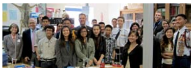
Mira Mesa HS Biotech Students, Congressman Peters, SD Workforce Partnership, AMGEN, and SCBC VIPs